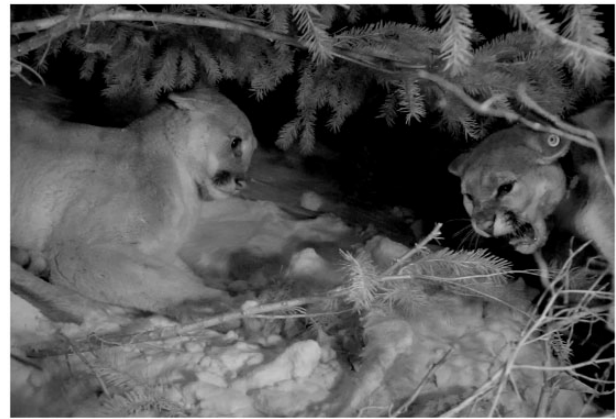
Figure 1. Characteristic hissing and posturing of adult female pumas Puma concolor meeting at a carcass.

The duration of interactions at puma kills was 25.4 \pm 27.8 h (SD) (range 2–121 h), whereas interactions unassociated with food sources were 8.7 \pm 18.2 h (SD) (range 1–76 h). We were only able to determine 2 cases in which an incoming puma displaced the puma that had made the kill; more typically, the pair alternated feeding at the carcass. Zero M-M interactions resulted in mortality, but 2 M-F interactions resulted in the death of the females. We classified the first event as predation rather than intraspecific strife. M68, a 2-yr old sub-adult male puma that we believe had not eaten for more than 5 weeks because we did not find prey remains at any place where GPS locations were aggregated; his last confirmed prey was a porcupine and he may have suffered injuries that limited his mobility