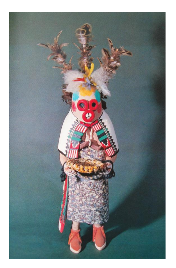
Katchina Doll Representative of Katchina Spirit Dancers