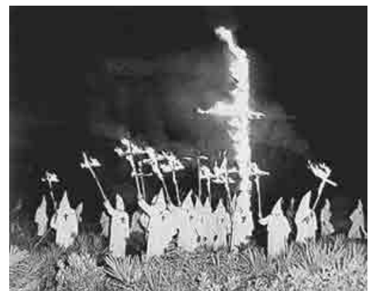
Klu Klux Klan, 1923