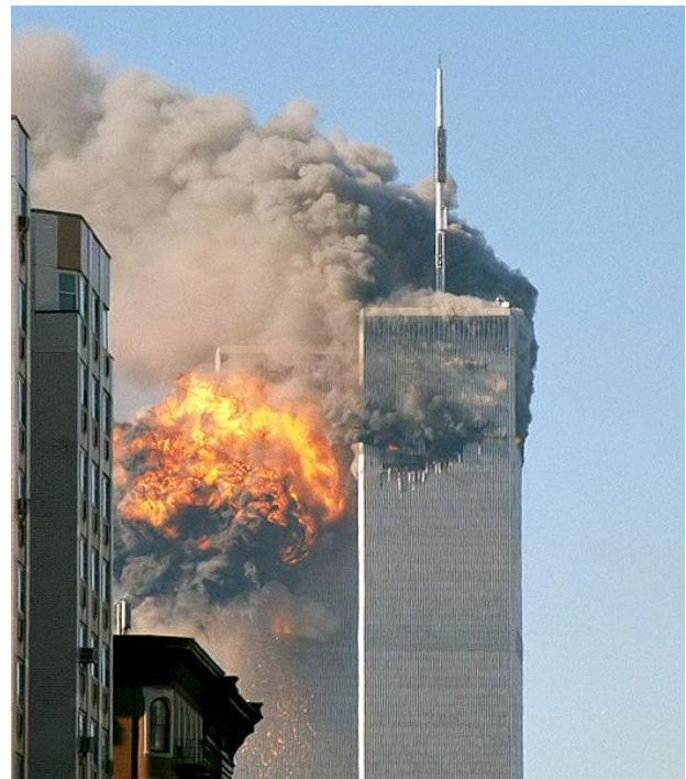
Twin Towers of the World Trade Center September 11, 2001

A community that embraces the values/teachings of objectification and separation (reality is made up of objects, separate from myself – the “walls of Jericho”) and gradation and dominion (I am superior and dominate over others – the “tower of Jericho”) is a community that tends to,