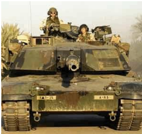
M1 Abrams Tank

Homo sapiens are the only known animal species to have had some of its kind deliberately organize themselves to hate others of its kind, and institutionally and systematically kill others of its own species, i.e., war among themselves. Hatred is being defined as an intense emotional dislike directed against individuals, social groups, or even objects or ideas. Hatred is often associated with feelings of anger and a disposition towards hostility directed at others. Not much “love” here. Hatred is much more than simply disliking a rival or adversary. Warfare is being defined as an organized and often prolonged conflict that is carried out between groups. Using armed conflict, one group attempts to subordinate another group by curtailing or eliminating its