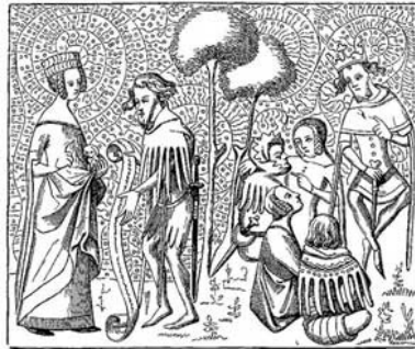
"Court of Love" in Provence, southeastern France, during the 14th Century