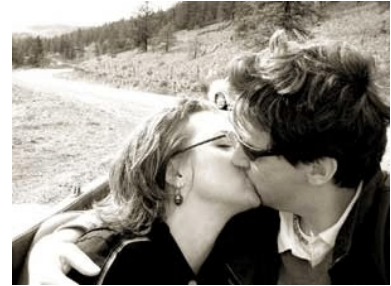
"Courtship" of a kiss

Many scholars identify "courtly love" as the "pure love" described in 1184 by Andreas Capellanus in De amore libri tres :