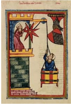
"Courtly Love" comes in a basket