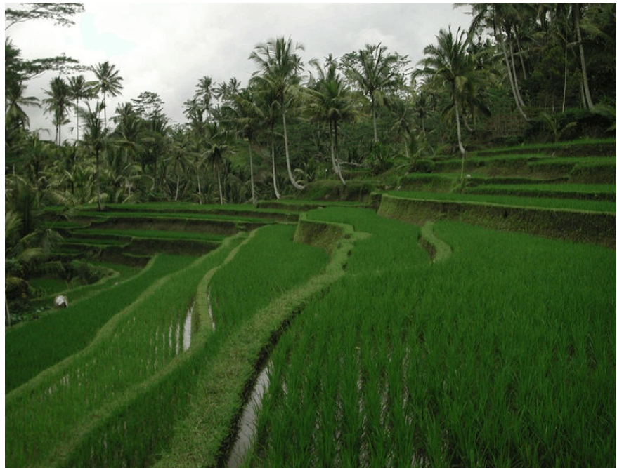
Rice fields ( sawah ) at the entrance to Gunung Kawi Temple