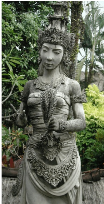
Rice Goddess Dewi Sri

No absolute lineal time – no idea of past, present and future