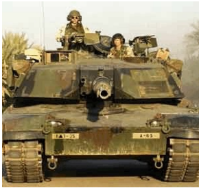
M1 Abrams Tank

“To be born, to change, to love, to win at games, is to be born to live in a time of peace. But war teaches us to lose everything and become what we are not. It all becomes a question of style.” Albert Camus.