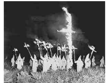
Klu Klux Klan, 1923

C. Hatred and warfare are more characteristic of a particular type of social organization and world view – a specific way of relating to other humans and life-forms all together? i.e., correlated with "exclusivity" (introduce or reiterate from ecological lectures). Implications of exclusivity on "hatred" and "war," and on the "ecological crisis."