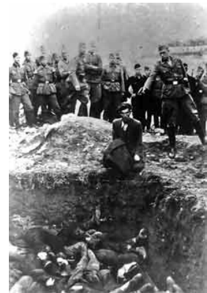
Last Jew in the Ukraine, 1941

A. Hatred and warfare are an expression of a healthy social organization, e.g., a way to channeling psychological tension or developing competitive skills, or helping solidify the social order, and is thus innate, endemic and fundamental to the human condition? Consider some theories on aggression and prejudice: