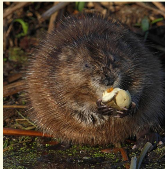
Muskrat ( Ondatra zibethicus )