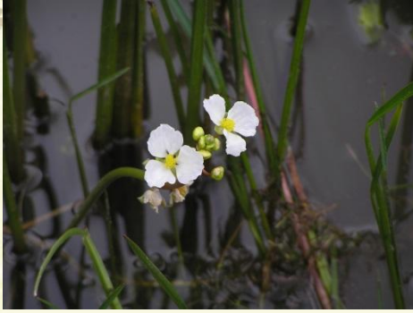
Flowering Water Potato

Outside of its importance as a traditional subsistence resource the water potato also offers great value as food and cover for aquatic animal life. The seed and tubers are readily consumed by waterfowl, songbirds, wading birds, muskrats and beaver. The emergent foliage of this species provides cover to the same animals in addition to fish and aquatic insects. During the growing season notable amounts of nutrients and metals are extracted from the water by the water potato. Stirring up of the sediments and erosion is reduced greatly by healthy stands of water potato. (USDA-NRCS) 2002.