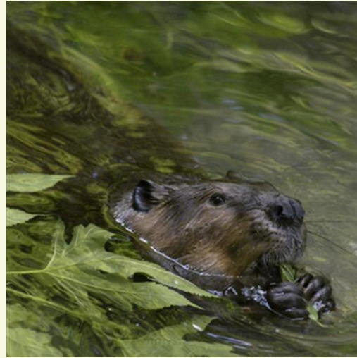
North American Beaver ( Castor canadensis )