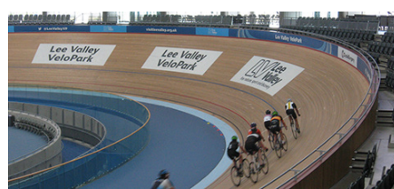
Velodrome, Michael Hopkins Architects