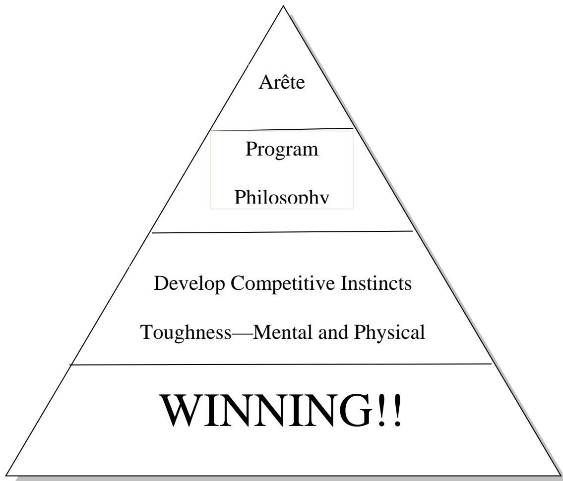
Figure 1 Realistic / Pragmatic Application for Cultural Development