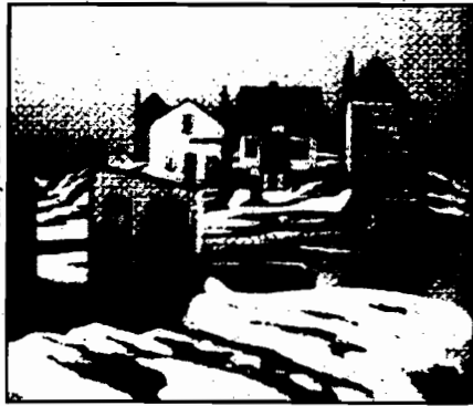
Lauren S. Harris / National Gallery of Ottawa