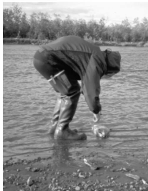
Figure 1 —Larry Barnes practicing catch and release fishing on the Kanektok River.

Snowball sampling with multiple origins (i.e., interviewees are asked to nominate additional sources of information) was used to identify key informants on conflicts (Miles and Huberman 1994). Semidirected interviews were conducted with individuals, interest groups, community representatives, and representatives from managing/regulatory agencies. Interviews were conducted with people having a variety of perspectives concerning conflicts between subsistence