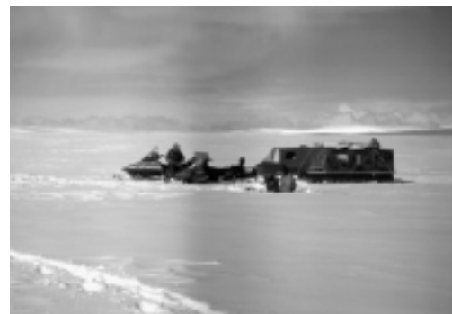
Figure 4—Recreational snowmobilers enjoy the spring weather in northwest Finland.

Rights to access, rights to decision making, and rights to self-determination emerged as a societal level of conflict and are considered intangible because they focus on broad philosophical issues rather than identifiable events. The participants in these conflicts were largely, but not exclusively, aligned by regional and ethnic identities. The conflicts transcended agencies and were directed at higher levels of government, such as national legislatures or global organizations. For