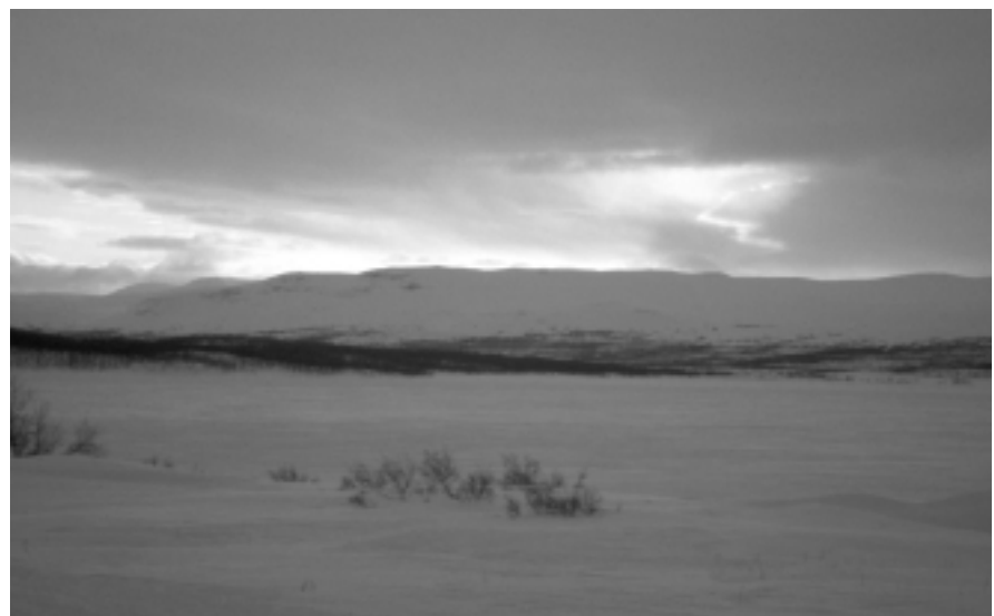
Figure 3—Midwinter light on the northwestern Finnish landscape.

In Finland, there were asymmetrical conflicts between subsistence reindeer herders and recreational users, including dog mushers and snowmobilers. Reindeer herders were disturbed by recreationists, but recreationists were not particularly disturbed by reindeer herders. Reindeer herders felt that sled dogs and snowmobiles spooked the reindeer