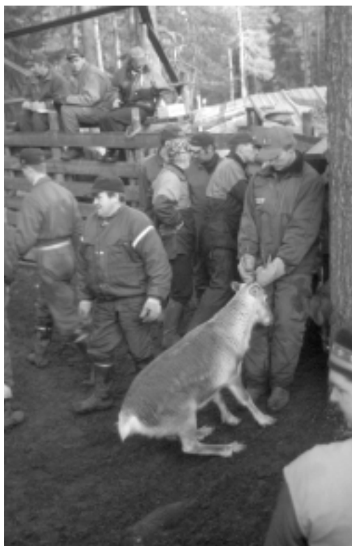
Figure 6—Finnish reindeer herders work on the fall round-up. Photo by Joan Kluwe.

In addition, indigenous rights groups and others (e.g., Alcorn 1993; Lane 2001) have suggested shifting to a comanagement structure to increase local voices in natural resource issues, enhance local self-determination, and address conflict at a societal level. Wilderness designation, or other protected area status, has been overlaid on historic indigenous territories. These designations have strong implications for future management of natural resources. Micro-level tangible conflicts have been easier to address in public planning processes; however, societal, judicial, and philosophical questions often remain as underlying factors. Wilderness managers dealing with subsistence issues need to look