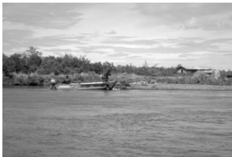
Figure 2 —Subsistence anglers work with their net in the Kanektok River.

and recreation uses: (1) local residents and community representatives who were familiar with subsistence uses, traditional lifestyles, and contemporary uses of wilderness resources; (2) representatives from tourism businesses familiar with past and present recreation uses in the area (e.g., dog safari and sport fishing companies); and (3) representatives from managing or regulatory agencies familiar with policy