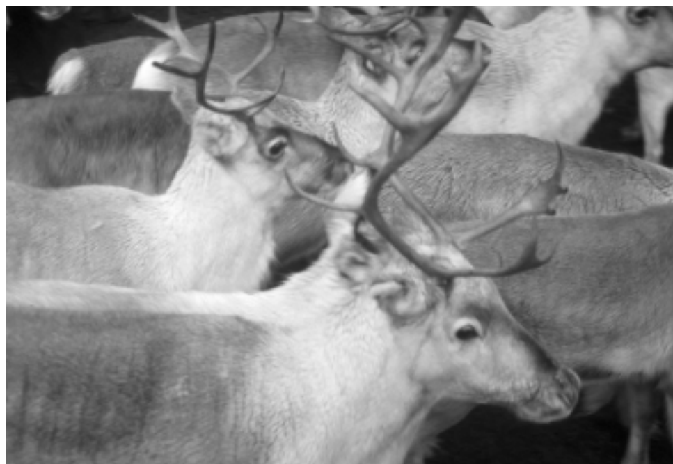
Figure 5—Reindeer are fundamental to subsistence lifestyles in northwest Finland.

It is difficult to neatly separate the components of conflict. All four components, or some combination thereof, may characterize an individual's position. Not all conflicts will display all