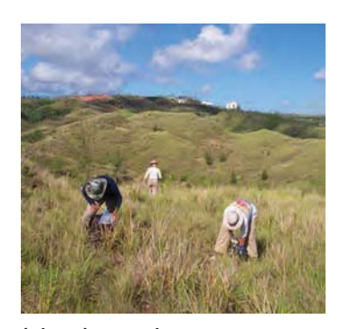
(Above) Natural resource managers at War in the Pacific National Historical Park, Guam, set up a plot to monitor erosion in the park savanna lands.