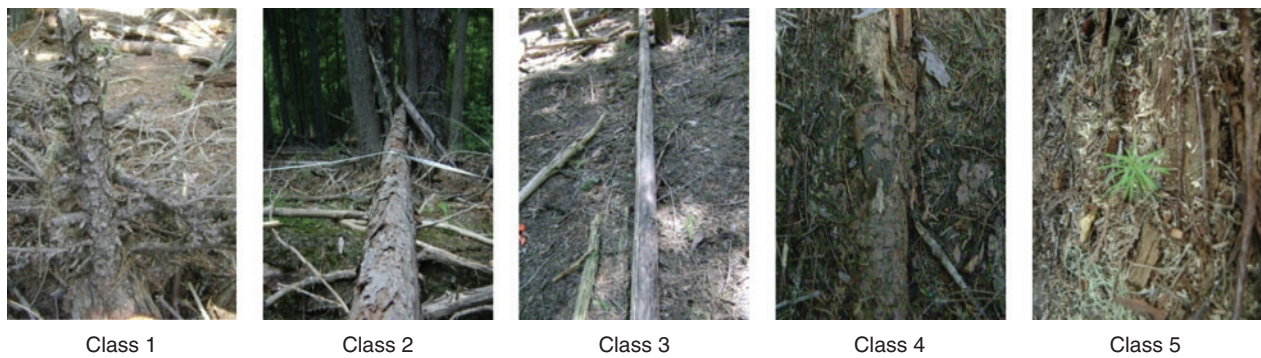
Fig. 1. Typical examples of mixed conifer coarse woody debris (CWD) in the decay classification system based on Maser et al. (1979).

In some cases, judging decay by the outward appearance of the logs may be a poor indicator of their overall condition. For example, logs occupying very dry exposed sites in southern Norway have appeared sound on the outside only to be decayed within (Næsset 1999). In this instance, referred to as case-hardening, decay is slowed on the surface of the log owing to inhospitable environmental conditions. Location of decay may also present some difficulty in applying this classification; several tree species are prone to heart rots, in which the core becomes rotten but the outer layers of wood remain sound.