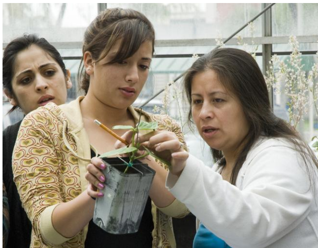
California State University, Los Angeles

38% of FY students at least occasionally spent time with faculty members on activities other than coursework.