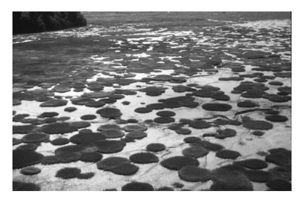
Fig. 1 Near-circular clones of Spartina alterniflora at Needle Point, Willapa Bay, north Pacific County,WA (46°30′46″N, 123°55′10″ W).

Spartina growth defines and maintains the shoreline along broad expanses of temperate coasts (Strong and Ayres 2009). As a result of growing lower in the intertidal zone than other vascular plants, Spartina can alter the physical, hydrological, and ecological environments of estuaries. Where native, Spartina is uniformly valued for the ability to hold and define the shoreline. For at least 500 years, Spartina has been spread around the world by humans, probably mostly on purpose. Where it is not native, Spartina is now mostly considered to be a bane. The tendencies of elevating shorelines to the point of transforming salt marsh into terrestrial habitat, of overgrowing native plants, threatening native animals, and of hybridizing with native Spartina species are what makes these