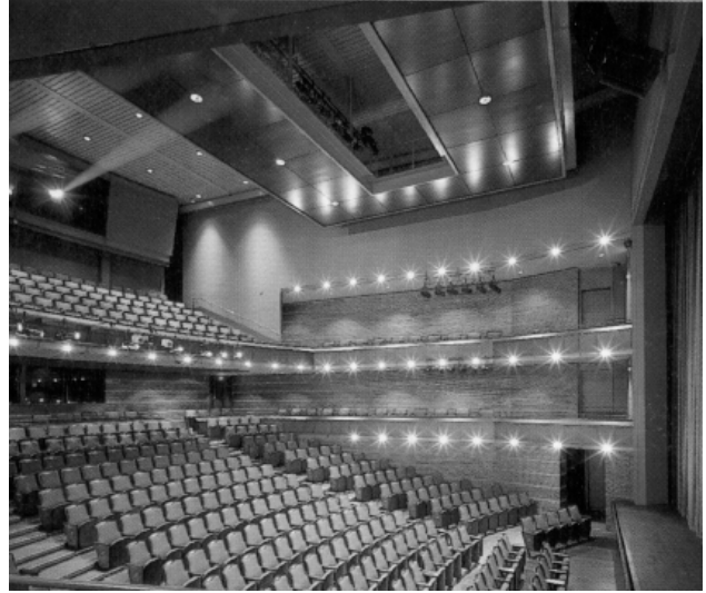
Interior of Victoria Hall

3. Do you think Victoria Hall is appropriate for its functions? Give a rationale for your opinion.