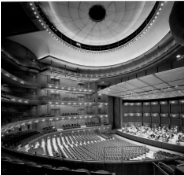
Interior of Prudential Hall