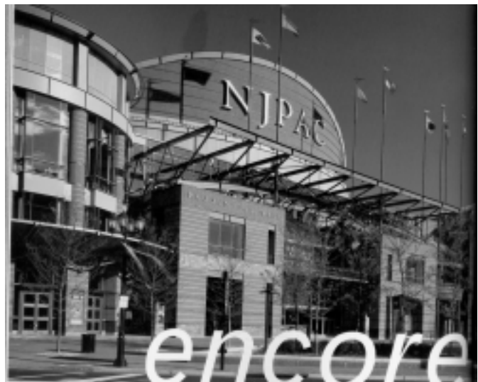
NJPAC street (south) elevation

In the nine page article the only mention of acoustics is "The imperative for the center's two auditoriums was to provide superior sound, sight, and intimacy. By all reports, the acoustics excel in the domed, horseshoe-shaped Prudential Hall, and the sight lines are clear—the conductor can be seen even from the side balconies. The wide, yet compact, 2,750-seat Prudential Hall, which houses the New Jersey Philharmonic and hosts operas, ballets, and musicals, keeps the stage close to the audience with geometric grace and atmospheric warmth. The curvilinear shapes of the ceiling, balconies, and perimeter walls ring the auditorium with stylistic grace. A second auditorium, Victoria Theatre, is black, stark, and edgy, an informal venue for classical and modernist chamber concerts and intimate, experimental theatre productions. Technically, the whole building is divided into seven contiguous structures: the two theatres, lobby, rotunda, restaurant, kitchen, and back-of-house facilities. Acoustic joints totally isolate each theatre. 'Newark is noisy with highways, trains, and planes,' explains Meyers. 'So we designed massive walls to keep the sound out.'"