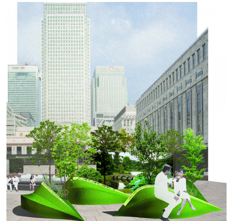
The Quintessential English Garden

Walk. A few blocks to the Crossrail Station, go to the roof.