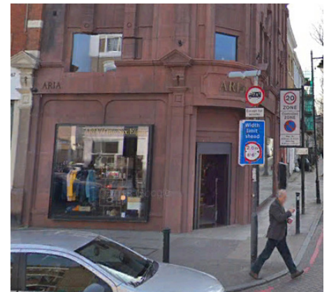
Upper Street facade of ARIA.

Walk back to Upper Street, turn left, go two blocks to ARIA on your left.