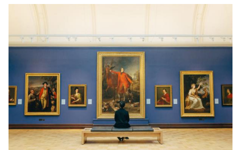
The National Portrait Gallery is in the heart of the New Town and has the best daylighted galleries.