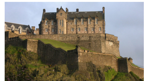
Edinburgh Castle is photogenically perched above Princes Street Gardens.

Enjoy exploring Edinburgh! There is more than the museums!