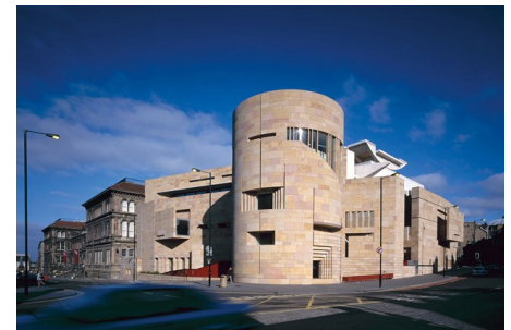
The National Museum of Scotland features all things Scottish and has a remarkable daylighted atrium or two.