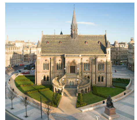
McManus Gallery has been Dundee's Art Gallery and Museum for over 150 years.

Enjoy exploring Dundee! There is so much more than the mu- seums! < https://www.visitscotland.com/destinations-maps/ dundee/see-do/ >