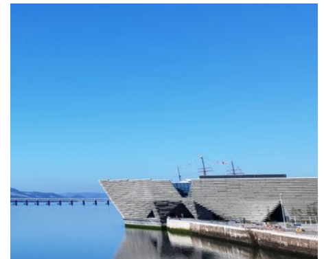
V & A Dundee by Kengo Kuma opened in 2018.