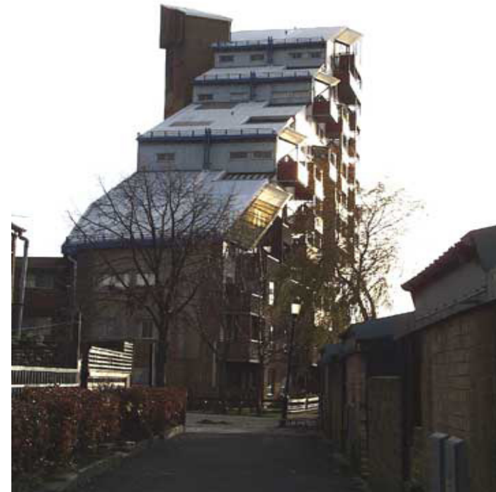
Byker Housing Complex Newcastle upon Tyne, England.