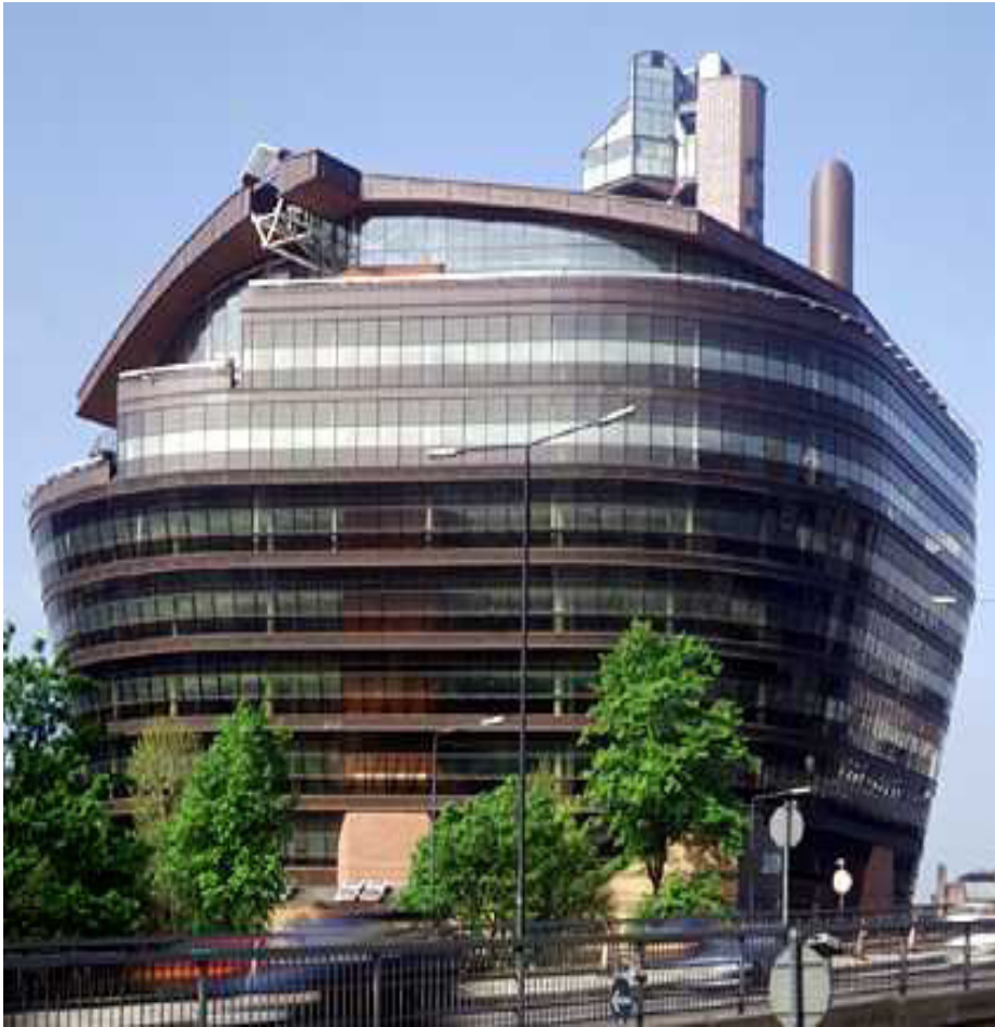
The Ark London England