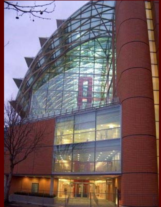
Evelina Children's Hospital