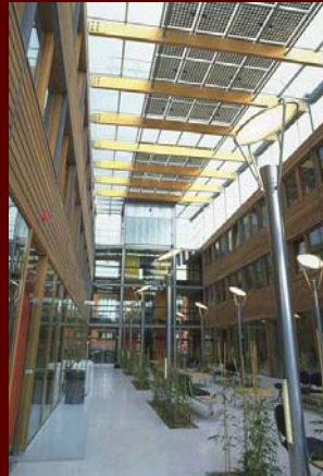
Jubilee Campus www.oja-services.nl