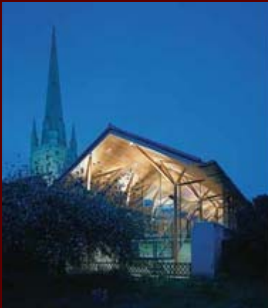
Norwich Cathedral Refectory www.architecture.com