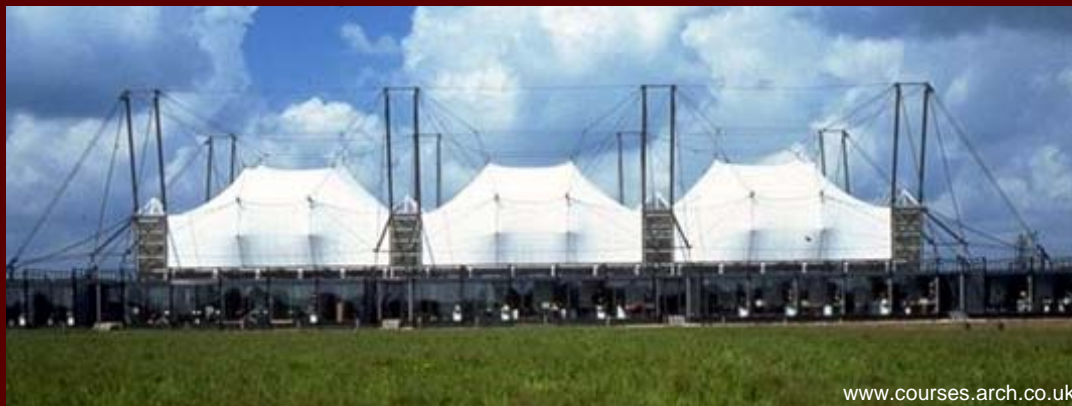
Schulamberger Cambridge Research Center

He is a trustee to the British Museum and served on the council of the Royal Institute for British Architects from 1991-1994.