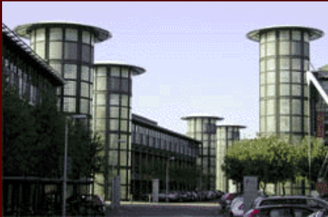
Inland Revenue Centre www.rmi.org