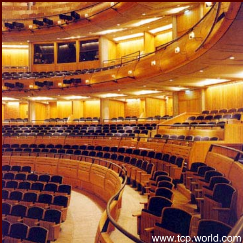
Glyndebourne Opera House

“In pursuing environmentally appropriate buildings we are committed to developing designs that reconcile the potentially conflicting ethical and financial interests of our clients. We aim to integrate first principle concepts that enable each building component to contribute to energy conservation and operational efficiency as well as to its appearance. The integration, rather than the duplication of elements which control the environment is fundamental to this end.”