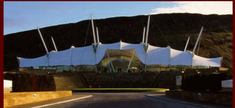
Dynamic Earth www.edinburghhpts.co.uk