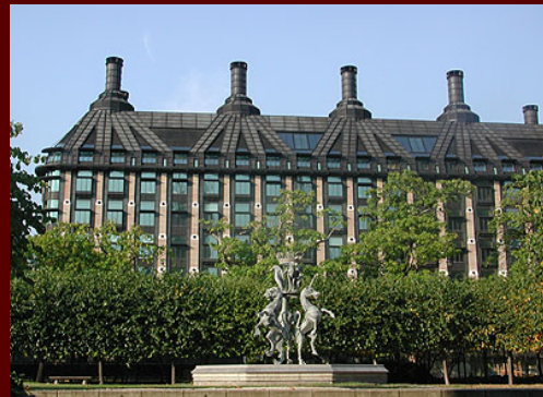
Portcullis House www.galinsky.com