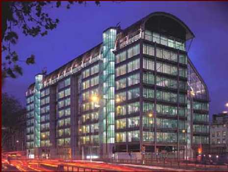
The Wellcome Trust www.hughpearman.com