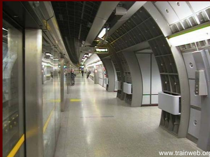
Westminster Underground Terminal