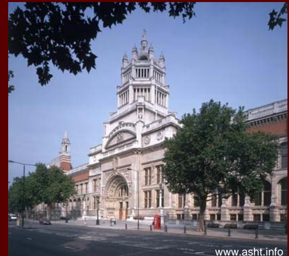
Victoria and Albert Museum