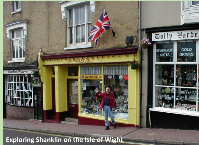
Exploring Shanklin on the Isle of Wight

The more comprehensive our global knowledge, the broader our basis for sustained stewardship of our diverse cultures and built and natural environments. As Mark Twain posited, "Travel is fatal to prejudice." Through experiencing other cultures, we also gain better understanding and appreciation of our own culture and its role in the global community.