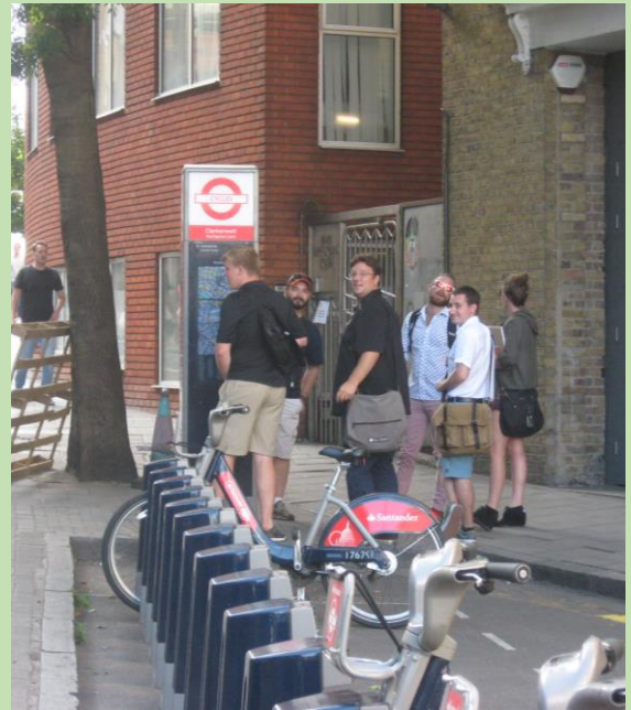
Do these folks look like Londoners?

—Rick Steves, Scotland , 1st edition p12.