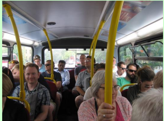
Ground Transport: On the bus to Greenwich during the 2015 Tube strike.

These estimates are high. Students can stay well within this budget.