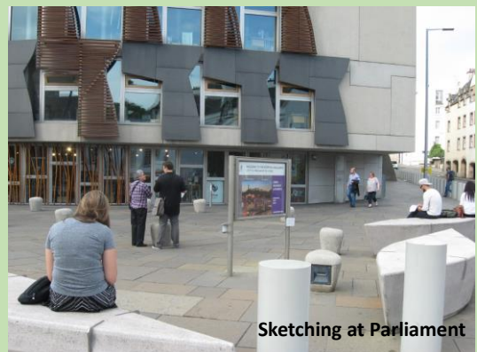
Sketching at Parliament