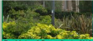
Tate Modern &amp; Rogers Condos 2015