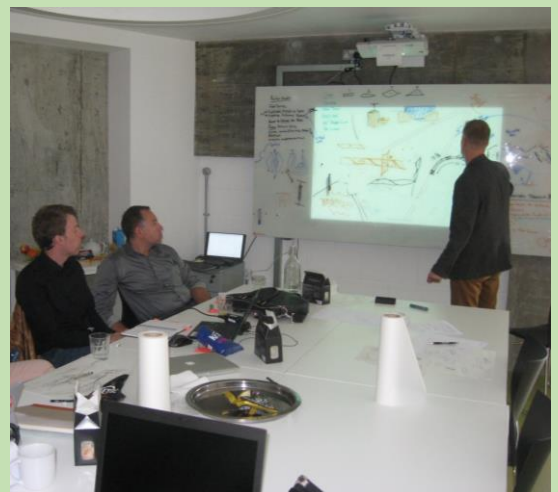
Team Fitzroy Square in charrette at Rivington Street Studio