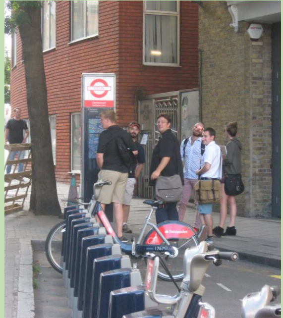
Do these folks look like Londoners?

—Rick Steves, Scotland , 1st edition p12.