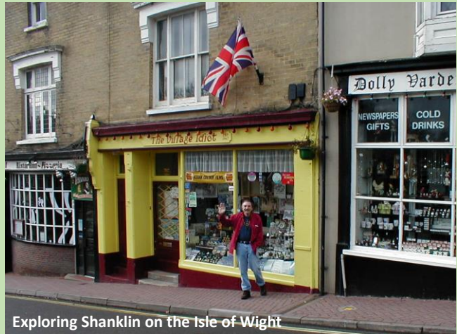
Exploring Shanklin on the Isle of Wight

The more comprehensive our global knowledge, the broader our basis for sustained stewardship of our diverse cultures and built and natural environments. As Mark Twain posited, “Travel is fatal to prejudice.” Through experiencing other cultures, we also gain better understanding and appreciation of our own culture and its role in the global community.