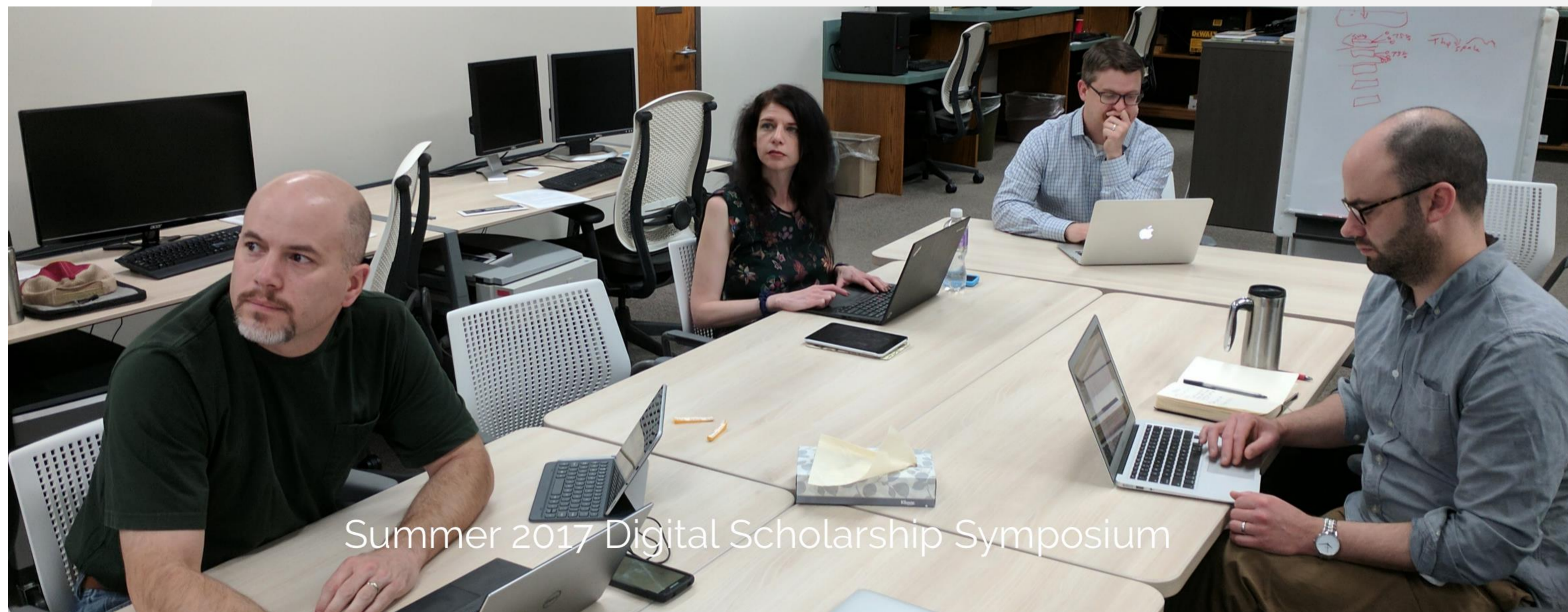
Summer 2017 Digital Scholarship Symposium