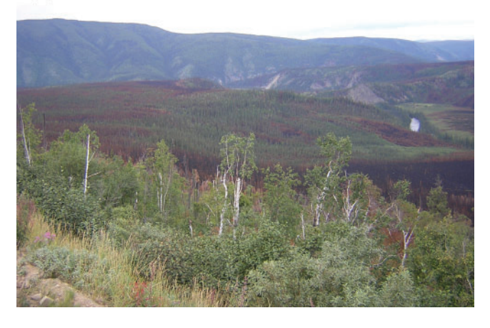
Fig. 2. Landscape-scale heterogeneity following fires. ( a ) California, ( b ) Montana, and ( c ) Alaska.

Current applications of remote sensing fire effects products