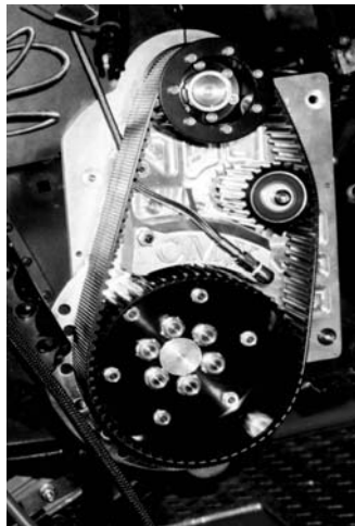
Figure 2 The belt drive system.

First, we incorporated a lightweight clutch. The second part of the transmission is the chain case. This is composed of two sprockets and a chain used to reduce the speed and increase the torque transferred to the track. This gear reduction system is encased in a metal housing and bathed in oil. Instead of this chain case system, the 2002 University of Idaho clean snowmobile utilized a belt drive system. This system is composed of two cogged drums each about 5 cm (2 in) deep, and a matching cog style belt. This system was chosen to reduce the vehicle weight and reduce the amount of rotating mass. A gear reduction of 2.1:1 was chosen as a moderate balance between speed and torque transferred to the track. The drum diameters are substantially larger than the diameters of the sprockets in the chain case and as such transfer power more efficiently. Figure 2 shows a picture of the belt drive installed on the 2002 snowmobile.