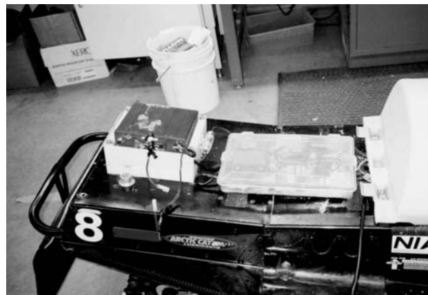
Figure 3 Electrical box and battery under the seat.

The electrical system is essentially the same as that used on the 2001 snowmobile. This year the electrical system has been spread out so that each component is easily accessible. Many of the relays and fuses along with the engine control unit were placed in a box located under the seat. Additional fuses were installed to protect the electrical system from short-circuiting. The same safety features are in place on the electrical system as were there on the 2001 snowmobile [3]. The tether switch and engine shutoff switch are connected in series to a relay that cuts power to all the essential systems in the engine. In this configuration, the engine cannot run without both the engine shutoff and tether switches in place. Figure 3 shows a picture of the electrical system layout underneath the seat.