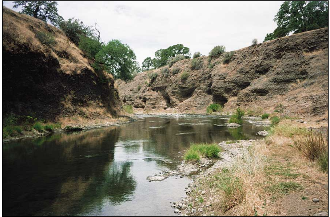
Figure 18. Access to floodplain. This site scores an 8 because there is a limited incision that reduces access to the floodplain to 3- to 5-year events. See figures 4, 5, and 17 for more examples of scoring access to floodplain.

Figure 17. Access to floodplain. This creek scores a 7 due to limited flooding. Flooding only takes place with large storm systems that occur approximately every 10 to 15 years. See figures 4, 5, and 18 for more examples of scoring access to floodplain.