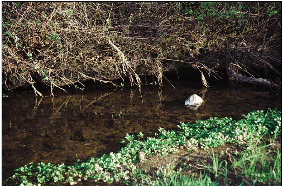
Figure 23. Fish habitat. A stable, undercut bank is a good fish habitat. See figures 11, 12, and 24 for more examples of fish habitat.

Not all of California's creeks and streams have the potential to support a fishery due to inadequate year-round flow, natural downstream obstructions such as waterfalls, and other natural factors. This question should be answered if it is reasonable to expect a fishery for the creek in question. Fish habitat is an important factor to consider (NRCS: p < 0.001 , R^2 = 0.996 ; EPA: p < 0.001 , R^2 = 0.996 ) and is scored similarly to macroinvertebrate habitat (Question 5), with possible habitat types including large woody debris, cobbles, boulders, aquatic vegetation, and riffles.