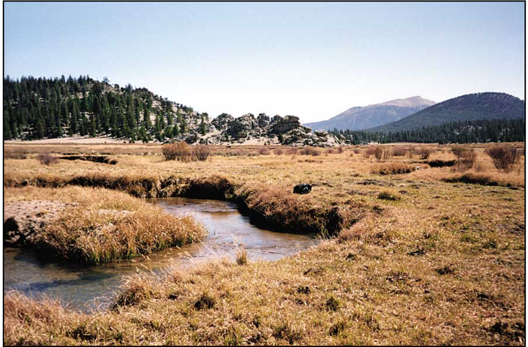
Figure 25. Channel flow. This site scores a 12 because of its full flow. See figure 26 for another example of scoring channel flow.

Even while considering that channel flow varies depending on the time of year, it is still an important factor to monitor (EPA: p < 0.001 , R^2 = 0.996 ). When water does not fill the majority of the channel, substrate can be exposed, limiting both fish and macroinvertebrate habitat potential. For intermittent or ephemeral creeks, the assessment should be completed while there is still a flowing creek.