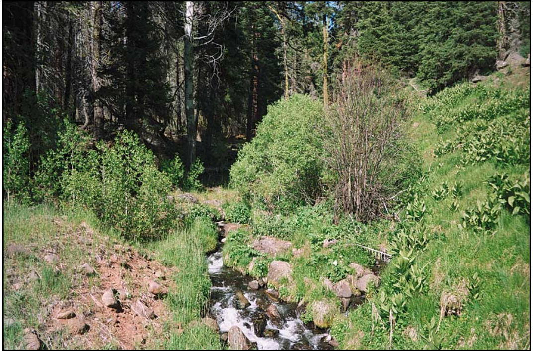
Figure 7. Bank stability. Active bank sloughing indicates a score of 2. See figures 6, 19, and 20 for more examples of scoring bank stability.