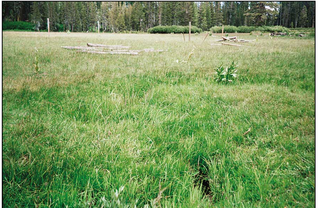
Figure 16. Channel condition. A score of 4 goes to this creek because the floodplain is restricted and downcutting has been extensive throughout the reach. See figures 2, 3, and 15 for more examples of scoring channel condition.

Figure 15. Channel condition. This site scores a 12 because this is the natural channel and there is no evidence of downcutting. See figures 2, 3, and 16 for more examples of scoring channel condition.