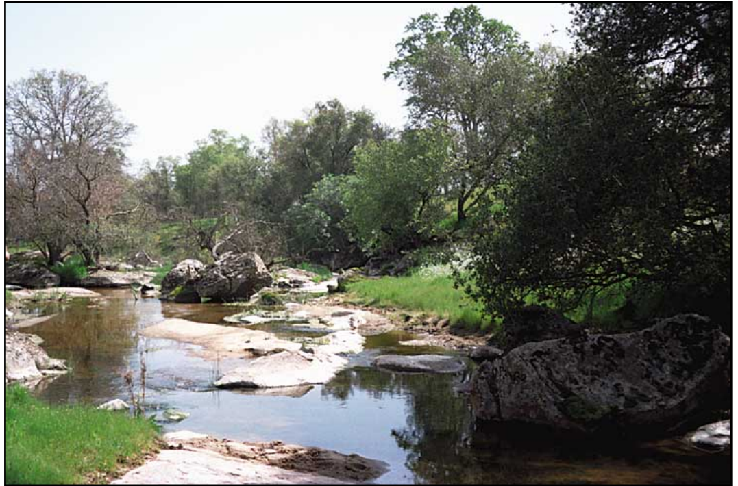
Figure 22. Riparian zone—intermittent creek. Due to the bare gravel bars, this creek scores a 10 (left bank: 4.5; right bank: 5.5). See figure 21 for more on scoring the riparian zone of an intermittent creek, and figures 8 and 9 for perennial systems.

Figure 21. Riparian zone—intermittent creek. This creek scores an 11 (left bank: 5; right bank: 6), noting the bare sand bars. See figure 22 for more on scoring the riparian zone of an intermittent creek, and figures 8 and 9 for perennial systems.