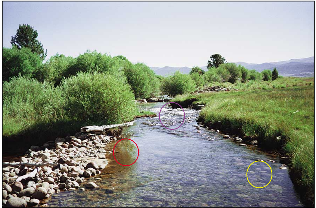
Figure 13. Velocity depth regime. A combination of fast-shallow (purple circle), fast-deep (yellow circle), and slow-shallow (red circle) regimes are present at this site.

High gradient creeks should have a variety of velocity depth regimes present, providing different habitat niches for various aquatic life. Fast-shallow sections add dissolved oxygen into the creek, and slow-deep sections allow fish cover out of the current. This question was again found to be a significant factor in stream health (EPA: p < 0.001 , R^2 = 0.997 ).