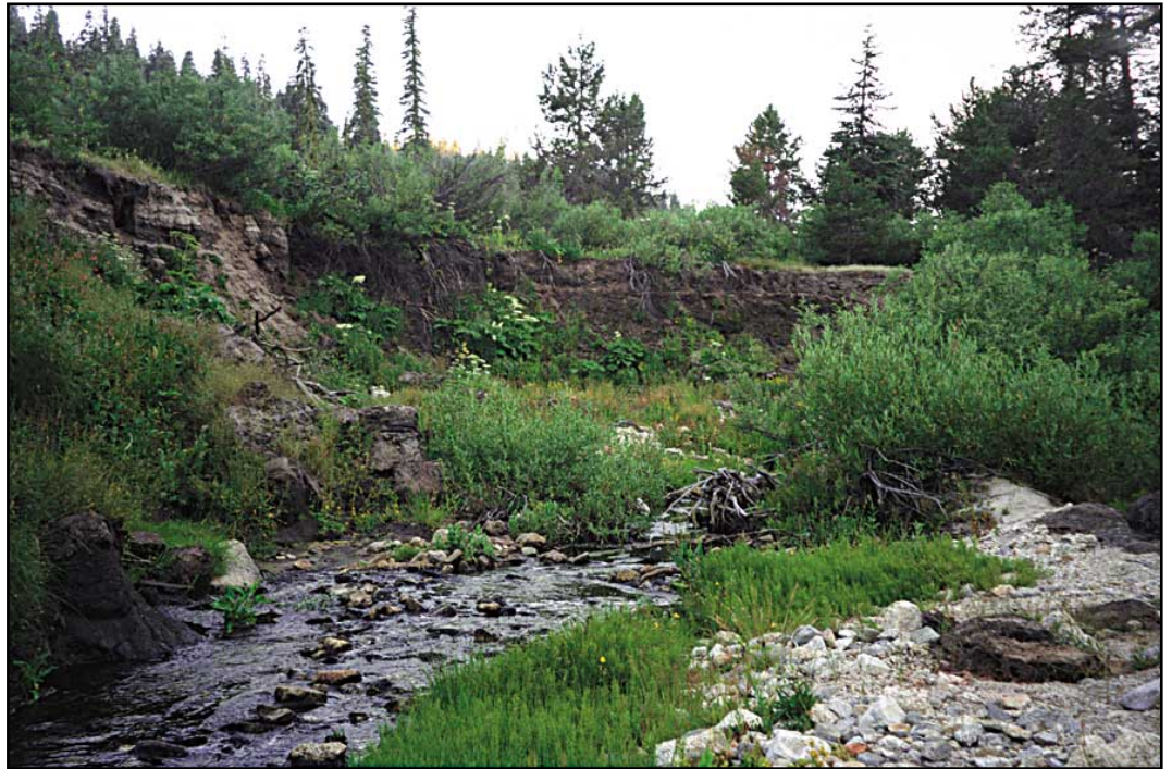
Figure 3. Channel condition. Evidence of past downcutting is one of the factors indicating a score of 8. See figures 2, 15, and 16 for more examples of scoring channel condition.

Figure 2. Channel condition. This creek scores a 3 since it no longer has access to the floodplain. See figures 3, 15, and 16 for more examples of scoring for channel condition.