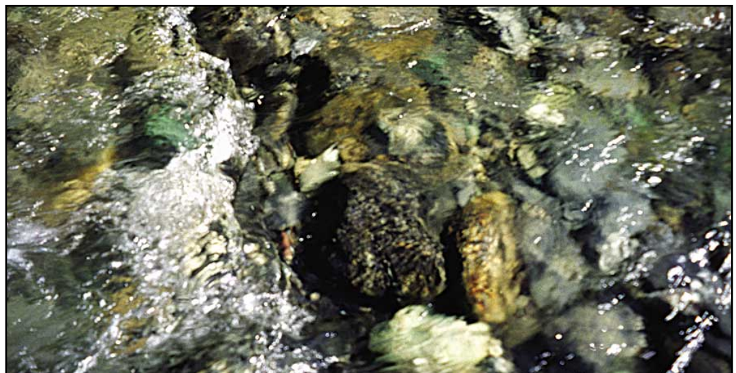
Figure 14. Riffle embeddedness. This creek shows a good example of a clean riffle.

High gradient creeks are dominated by riffles, important features in both dissipating velocity and providing habitat. To function properly, riffles should be free of sediment and the cobble and gravel substrate should not be embedded in the silts and clays. This question was evaluated by the percent of fines accumulating in the riffle (EPA: p = 0.027 , R^2 = 0.997 ).