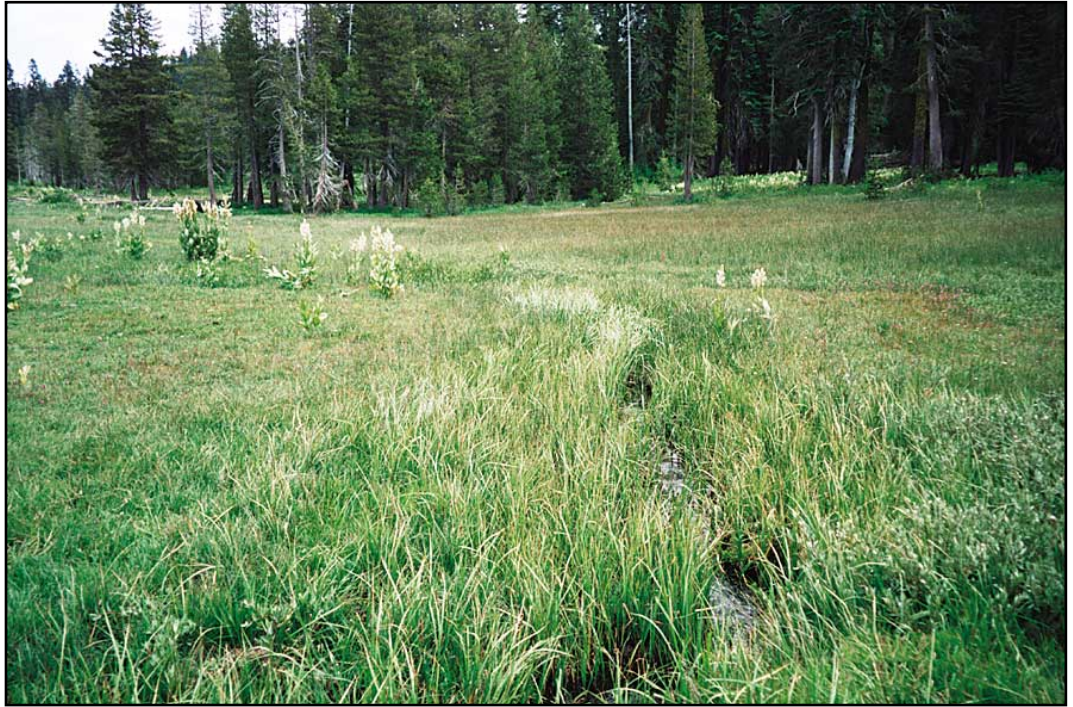
Figure 9. Riparian zone—perennial creek. Due to lack of vegetation, this creek scores a 1. See figure 8 for another example of scoring the riparian zone of a perennial creek. See figures 21 and 22 for annual systems.

Figure 8. Riparian zone—perennial creek. This site scores a perfect 12. See figure 9 for another example of scoring the riparian zone of a perennial creek. See figures 21 and 22 for examples of scoring the riparian zone of annual systems.