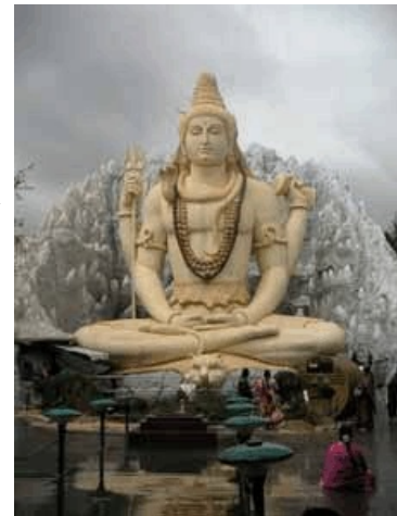
Statue of Shiva in the yogic lotus position - Bangalore, India

As with the other forms of Yoga, the ultimate goal of Raja Yoga is to seek to have one achieve a state of liberation and obtain Moksha . But Raja Yoga encompasses and differentiates itself from other forms of Yogas by using meditation to avoid mental obsessions and false mental states – to limit the oscillation of the “mind.” One’s thoughts and feelings, one’s perceptions and memories can just as easily distort and veil the true Self, becoming obsessed with attachments and desires. As a meditative method, Raja Yoga seeks to dissolve these mental barriers in order to further one’s acquaintance with Reality, and control the life-forces of the Universe to better realize the universal Self.